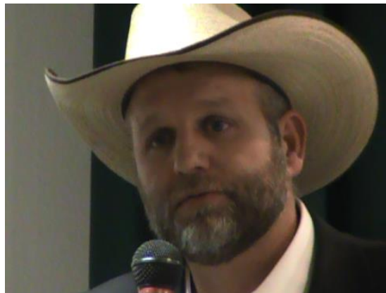
Above Photo: An Implacable Ammon Bundy

Smoothly confident in his vision, Ammon Bundy delivered a masterful portrait, a collage of concepts which reflected an intense embrace in his heart and mind of the U.S. Constitution, as written. It was most impressive to see the calmness which marks Ammon’s personality.